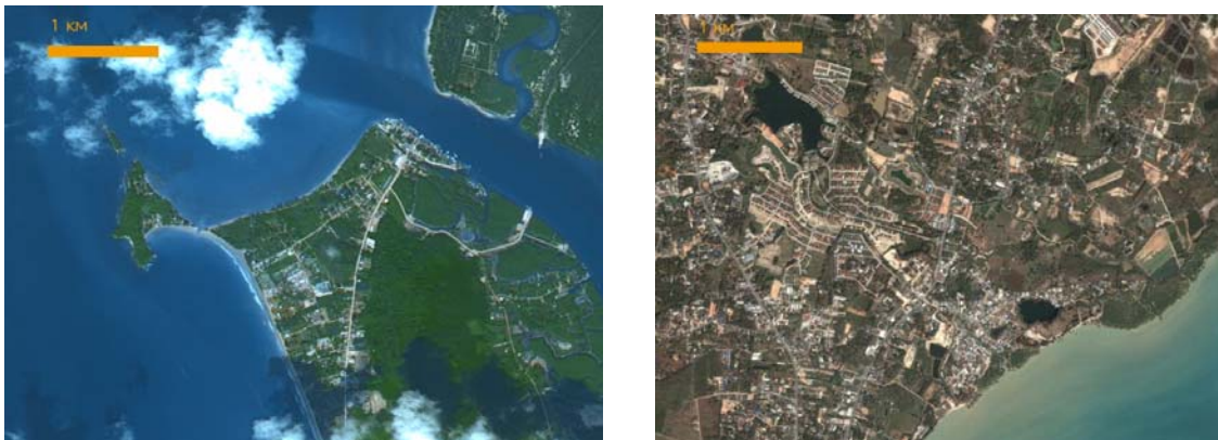
FIGURE 3. Comparison of the most developed area on Lanta Yai to Phuket at the same scale [1].

correlated with its regional transportation connections. Following the erection of a bridge connection Phuket to the mainland, development activity exploded on the island. Travel by car is now the primary form of transport on Phuket, and the island has some of the highest traffic accident rates in the country [7]. Phuket is an island of tourists and for tourists. Such intense development has forced natives to relocate due to the high cost of living and the virtual elimination of locally-owned enterprises. The precedent set by this internationally-known Thai tourist island does not bode well for Lanta, which has similar natural resources but is adamantly opposed to the nature (party-centric) and quantity of tourists that Phuket attracts. Communities on Lanta strongly wish to retain their cultural heritage, even though the dramatic increase in tourism has already begun to transform lifestyles of peoples such as the Urak Lawoi [8].