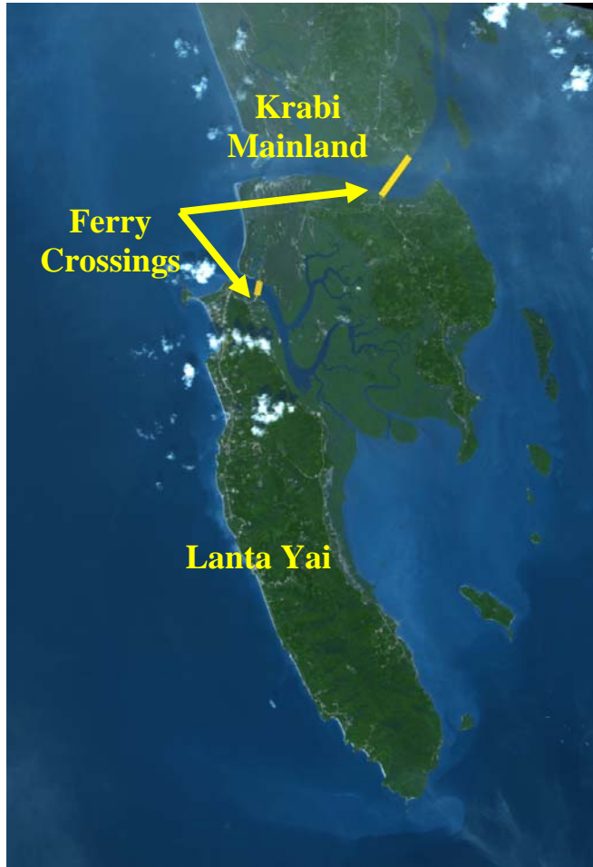
FIGURE 1. Aerial view of Lanta Noi and Lanta Yai showing ferry landings [1].